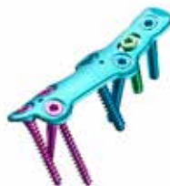
TCP Total Compression Plate