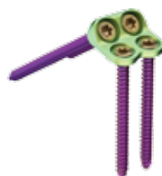
ORTHOLOC® 3Di MDCO Plate

ORTHOLOC® MDCO Plates TCP Total Compression Plates CHARLOTTE® CLAW®II Plates CHARLOTTE® Snap-Off Screws CHARLOTTE® Quick Staple