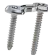
CHARLOTTE® CLAW®II Polyaxial Compression Plating System